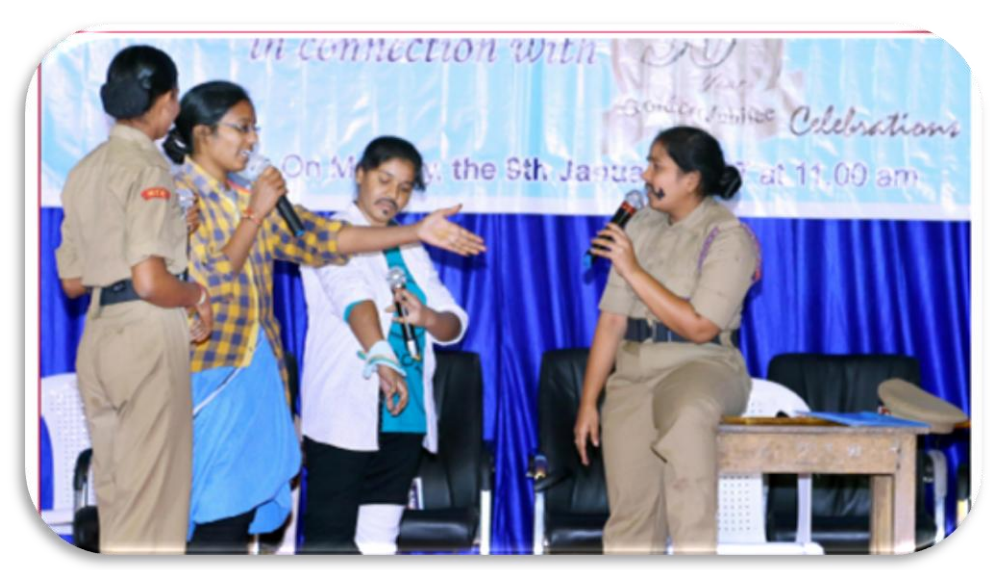
Play let by Present Students