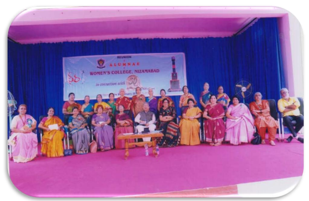
1st Batch students with Guests