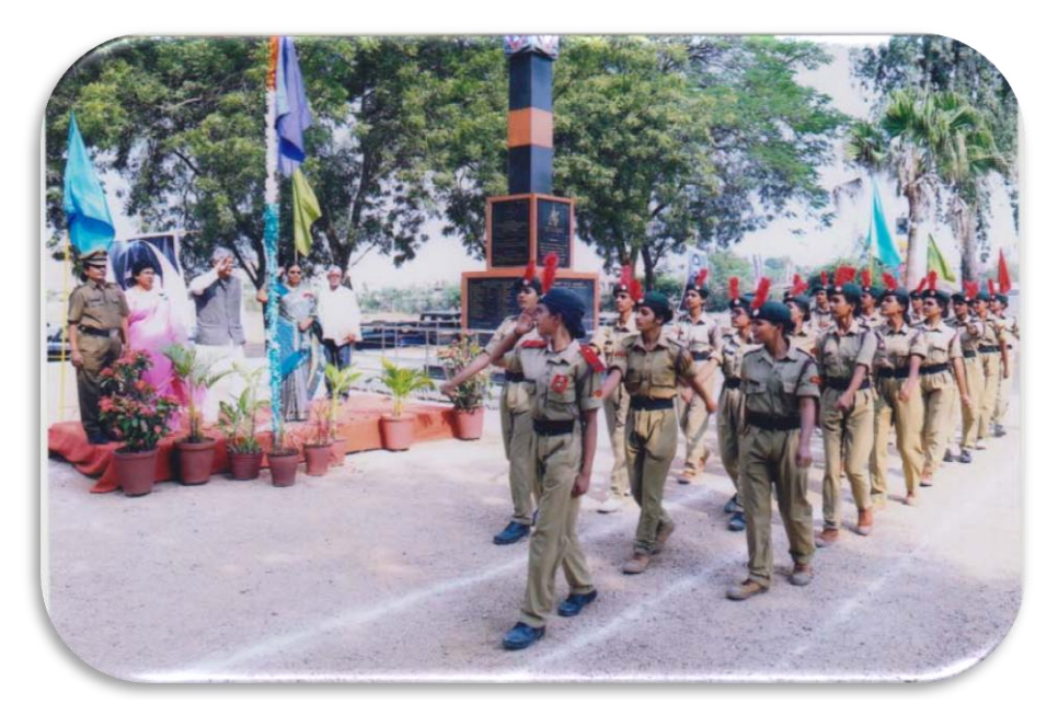
Parade by NCC Cadets