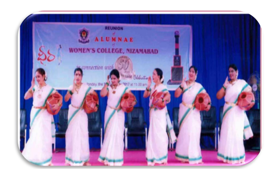
Cultural Programme by Alumnae