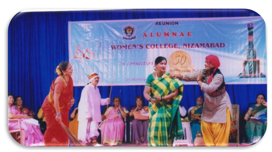
Cultural Programme by Alumnae