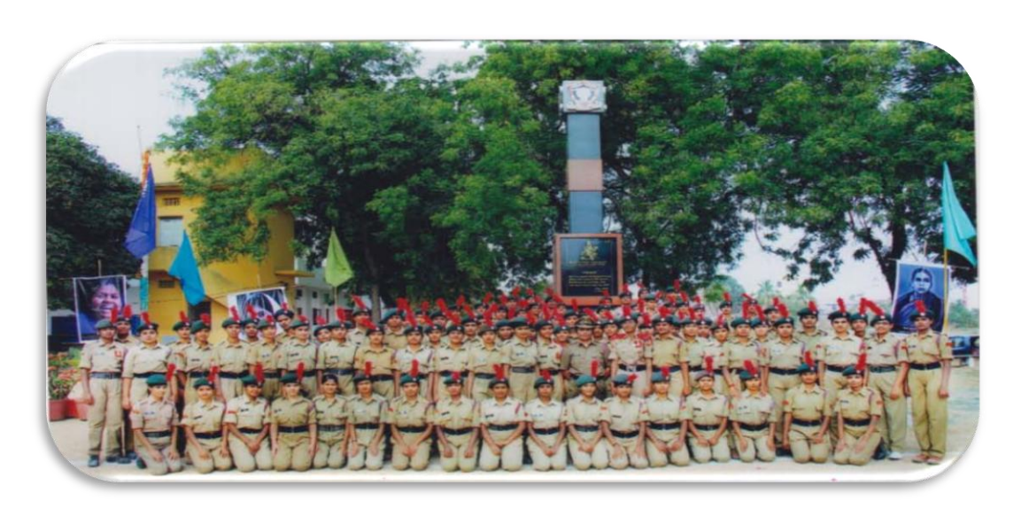
NCC Cadets in front of Golden Jubilee Pylon