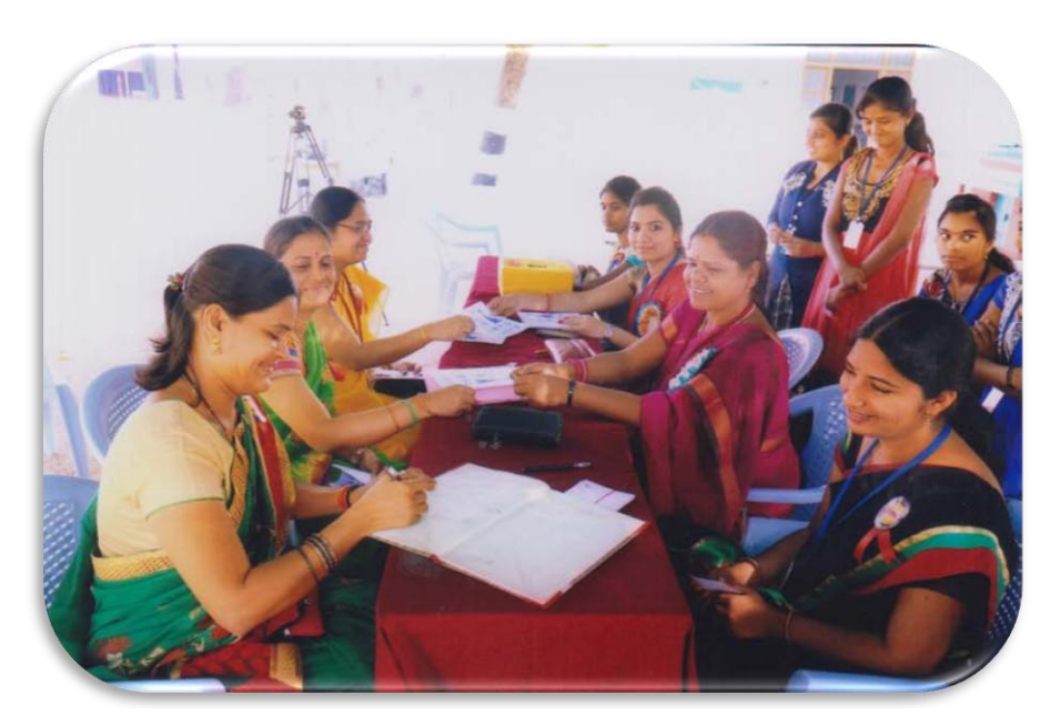
Alumnae at the Registration Counter