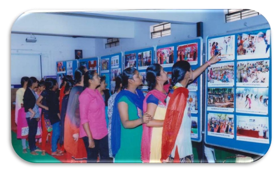
Present students watching the Photography Exhibition