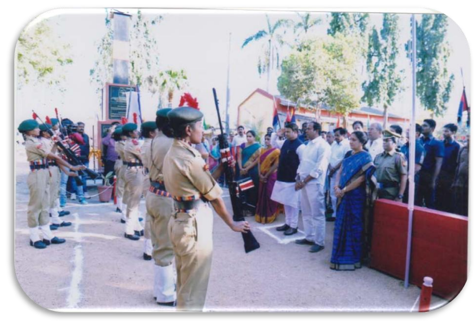
Guard of Honour